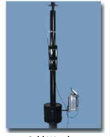
Cold Weather Insulation Kit