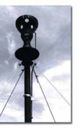
Guy Wire Kit